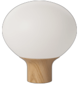
Acorn Table Lamp Ø32 cm