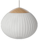
Acorn Pendant Ø64 cm