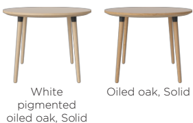
White pigmented oiled oak, Solid