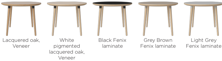
Lacquered oak, Veneer