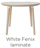
White Fenix laminate